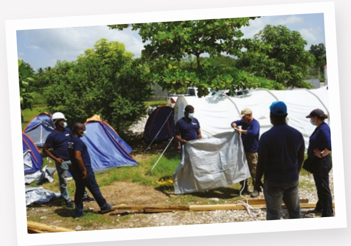
The ShelterBox team working with the Habitat for Humanity ^ team, whilst carrying out some shelter kit training.

We also included a cash payment for families to buy materials or hire a labourer to clear rubble and help with construction. And it could cushion them financially from selling their aid items just to be able to eat.